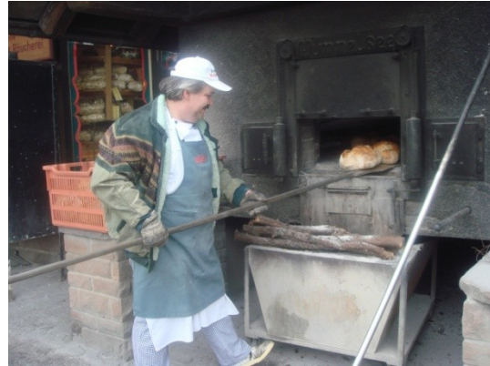
BAKERY IN THE BLACK FOREST