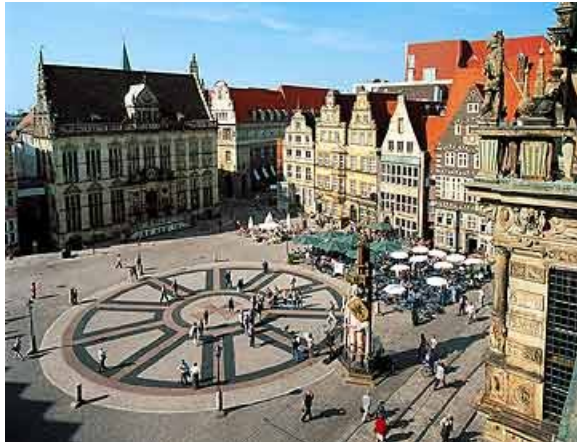
Marketplatz in Bremen, Germany