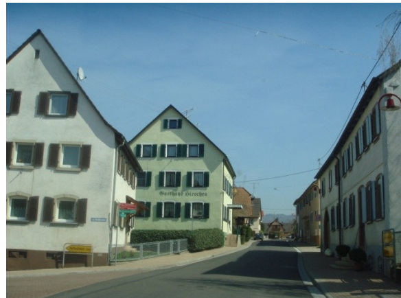
STREET IN WAGENSTADT